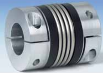
with clamping hub